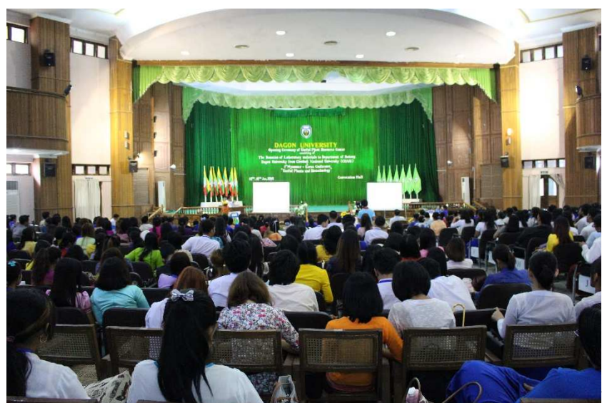
Dagon University & Chonbuk University host the Conference about "Useful Plant and Technology"