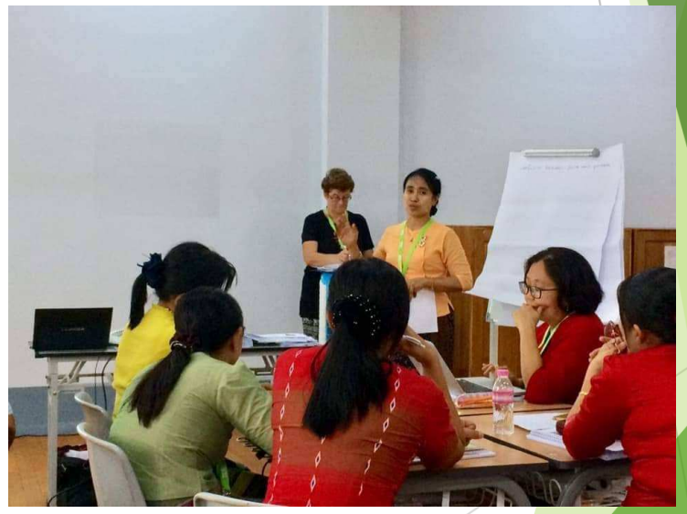
TIDE (Transformation by Innovation in Distance Education